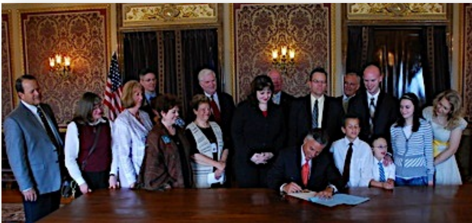
Legislators, Utah State Office of Education, USDB Institutional Council members and staff, parents and JMS students are gathering at Utah State Capitol to witness Utah Governor Jon M. Huntsman sign a House Bill 296 into law on April 30, 2009