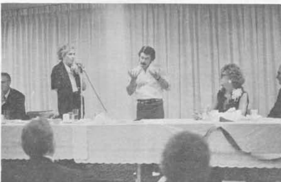
Comments from the general chairman.

parently made many people weep for they hated to bid one another goodbye.