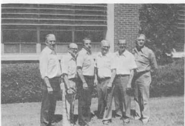
A typical class reunion picture.