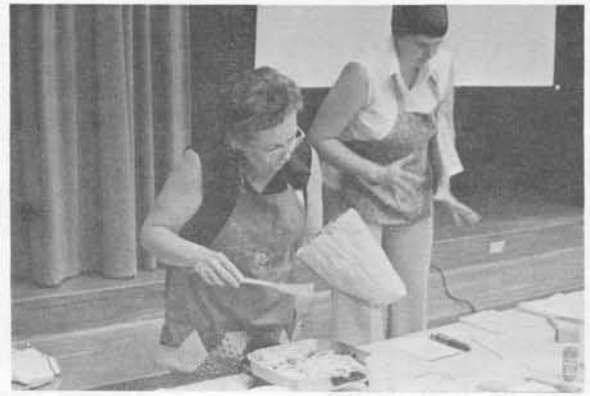
Cooking Spanish liver economically.