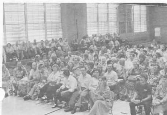
A captive audience, indeed!