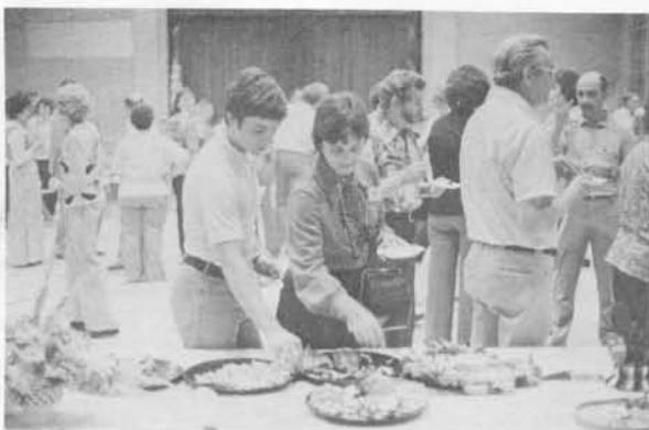
"One piece of each, please."