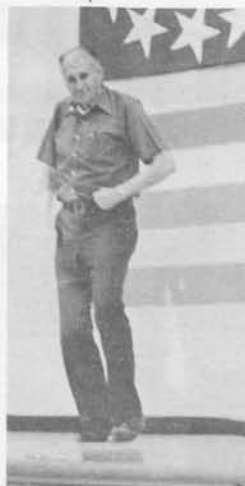
The hero or the villain or the heroine?

Continued From Page One by the cast (note the picture).