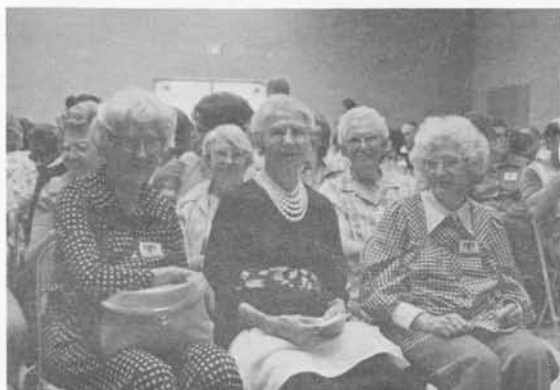
Keeping old friends . . .