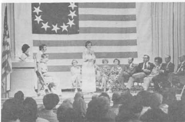
Honoring the USD staff members.