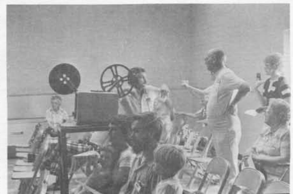
"Movies revive memories."