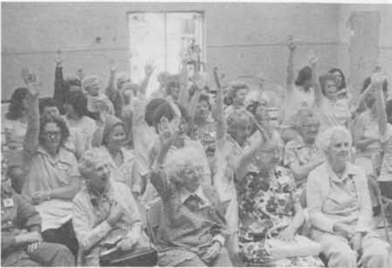
"Oh, I know the answer."