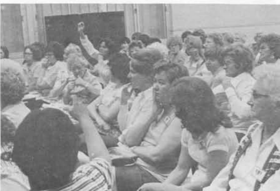
"Back-to-school" for everyone.