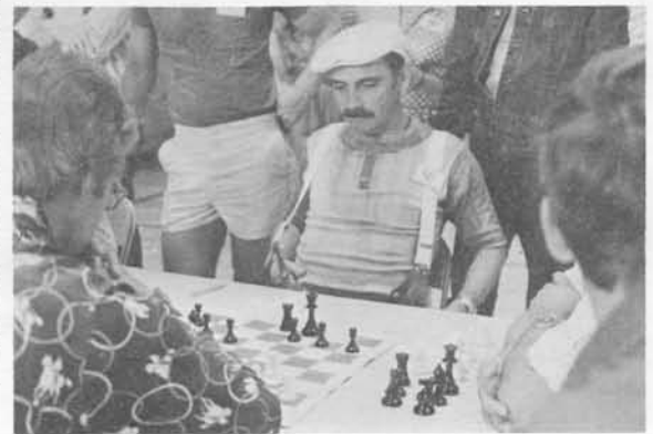
Thinking game in action.