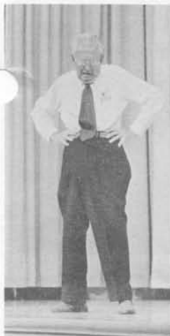
"Once upon a time . . ."