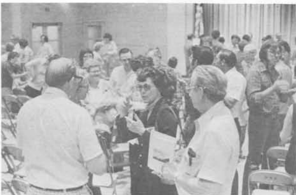
Sharing memories at the social hour.