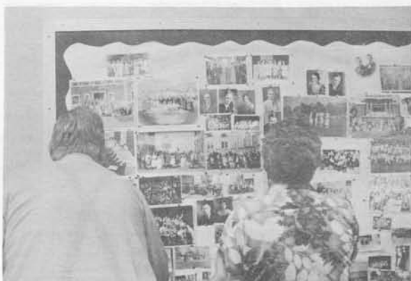
"Aaah, that's my old girl friend."