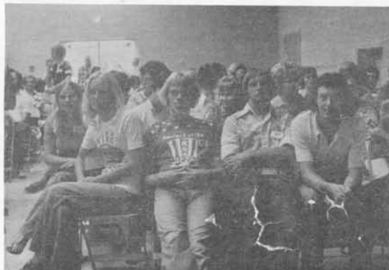
Youths are participating.