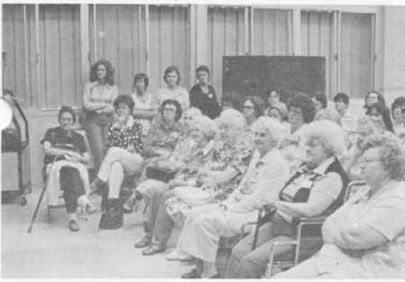
Learning is forever.

Multi-Purpose Room of Primary Hall. A 24-minute captioned video tape of an economist explaining how to be economical was shown. Then the two so-called instructors alternatively enriched the participants' knowledge on how to save money on meat. A demonstration on how to cook Spanish liver followed. The aroma of liver and onions attracted many outsiders nearby who were not attending this workshop. Surprisingly, many who loathed liver liked this dish. Materials such as recipes and booklets were distributed. According to evaluation it was highly enjoyed by all.