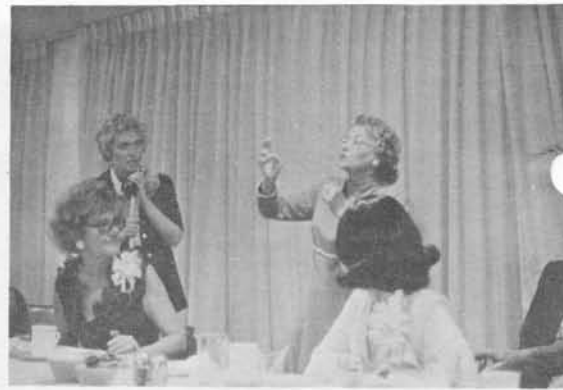
Signed songs are beautiful.