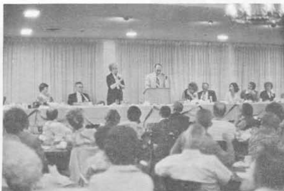
A trip in the Time-Machine.