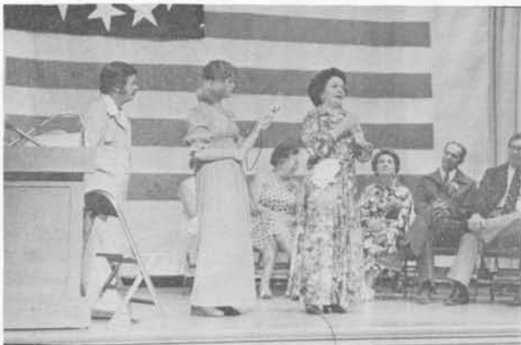
Profound gratitude expressed.