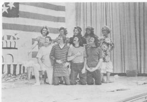
Smiling for the "1905" group picture.