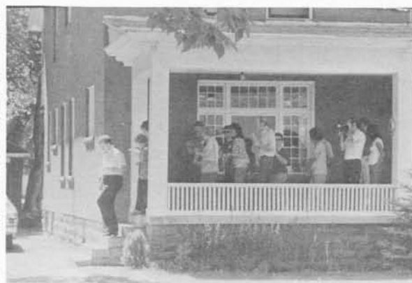
Friends, follow the leader.