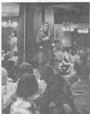
Indispensable interpreters at work.

A total of 370 people registered at the USD Reunion. Approximately seventy-five alumni came from other states such as Oregon, Idaho, Colorado, California, Nevada, Arizona, and Indiana. Will this record be broken in 1984 when USD marks its 100th anniversary with the second Reunion? Hopefully so! So long, farewell, auf wiedersehen, goodbye till the 1984 reunion!