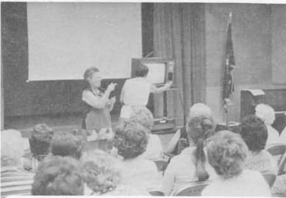
Modern captioned TV lesson.