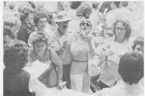
Yumm — yumm, liver is tasty!