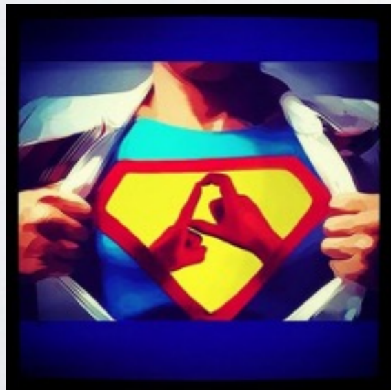
Deaf Culture and Identities